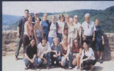
Students visit the Marksburg Castle as they learn about the history and culture of Germany, where they are studying Psychology.