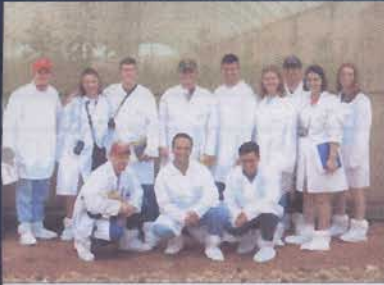
Students at a green house during a field trip in a Brazilian study abroad program.

The first step in this process is recognizing that costs differ when one studies abroad. For example, while some fees don't apply to study abroad students, such as the Health Center fee and the Student Center Complex fee, living expenses can be higher depending on the value of the U.S. dollar to the local currency. In addition, other increased costs include travel expenses such as airfare and cultural excursions for personal enjoyment. The chart below demonstrates the difference between the costs of studying abroad or studying at Texas A&M University as estimated by Student Financial Services and Study Abroad Program. Once the budget to study abroad is developed, the student Financial Aid staff help students adjust their aid packages to accommodate these costs. An example of this appears on the back of this page.