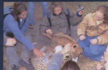
The South Africa Nature Tourism trip helps students understand wildlife ecology and management.