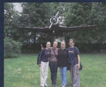
Aggie students visit the Dulka museum in Poland to learn more about World War II history.