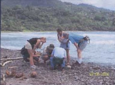
Students work on a field research project in Dominica

An investment in an international experience pays!