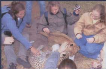
The South Africa Nature Tourism trip helps students understand wildlife ecology and management.