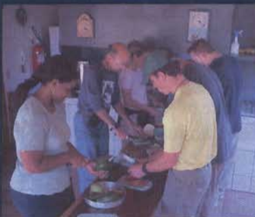
Students participate in a cooking class in Costa Rica