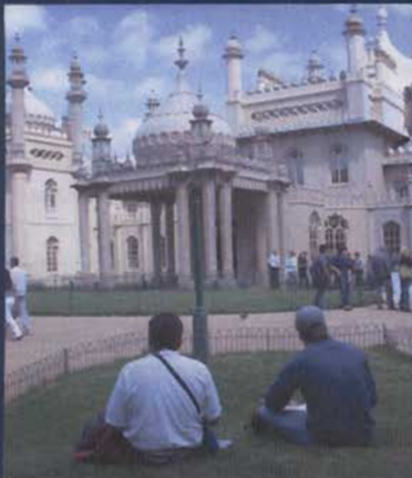
For Architecture students, sketching is a critical job skill. These students are at the Brighton Pavilion on a trip to the United Kingdom.