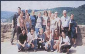
Students visit the Marksburg Castle as they learn about the history and culture of Germany, where they are studying psychology